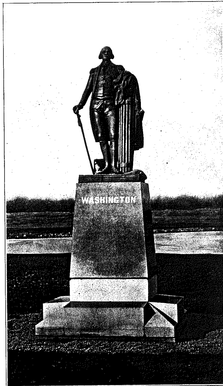
Washington Statue in Menominee Park